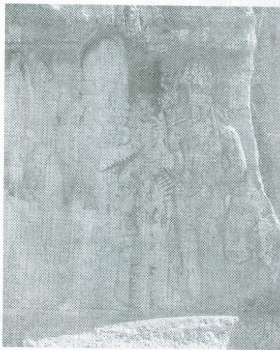
Figure 7 Investiture of Narseh, Naqsh-e Rostam.

period, continuing through into the Sasanian period (Shepherd 1964: 82). She also mentioned that artists from the Seleucid and Parthian periods had imitated the Greeks. Their way of rendering the female figure was used as a prototype. So, the four figures depicted on the Cleveland vase, each according to the symbols, which they hold, show different characteristics or attributes of the goddess Anahita. For instance bucket and bird are her symbols as a goddess of water; vine and flower her symbols as goddess of vegetation; the dog is her symbol as guardian of home and flocks; the bowl of fruit is her symbol as goddess of agriculture; and the child and pomegranate her symbols as goddess of fertility (Shepherd 1964: 84).