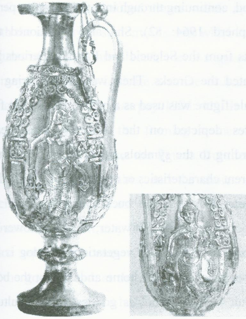
Figure 4 Silver-gilt ewer with female figure (right) holding a ewer in her hand, Metropolitan Museum of Art.