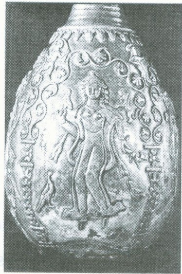
Figure 2 Silver vase showing a female holding a panther and a bird, National Museum, Tehran.

From the surviving objects of Sasanian silverwork, it seems that, after the royal figure depicted on the body of silver vessels, the numerous female figures, in dancing or walking pose, might be the next in terms of quantity. In addition, a small subset of female figures includes musicians playing the flute, guitar, or harp. The motifs are depicted on the body of a variety of vessels such as vases (Figures 1, 2), ewers (Figures 3, 4), plates (Figure 5), and bowls (Figure 6) with vase predominating. The exterior surface of the vessels, particularly in ewers and vases, is usually divided into two to four or six segments in the form of arched frames, each showing a female figure with number of distinctive details, often holding different objects.