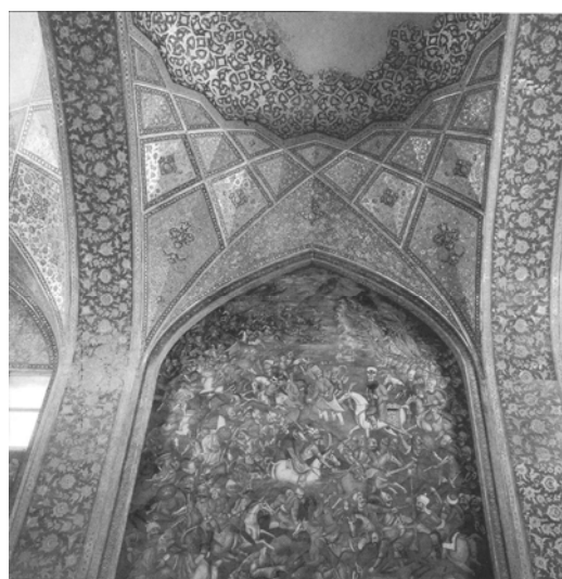
Figure 7 Shah Ismail in Battle against The Ottomans, Mural painting, Chihil Sutun palace, Isfahan, 1647-1650

In Shah Ismail's era, another type of painting emerged, characterized by and known as dervish scenes. Their subject matter surrounds the event of Karbala (Figure 8). Missionaries displayed these scenes to people in villages and the bazaar. This was done to arouse people's religious emotions and encouraged