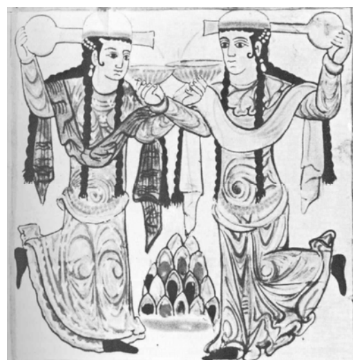
Figure 3 The courtly ethos, Mural painting, Jawsaq al-Khaqani palace, Samarra, 836-9 (Abbasid era)

In Mesopotamia, attempts were made to illustrate stories, fables and scientific books in the 13 th century. Attempts to advance these arts were made by artists to illustrate books such as Maqamate Hariri (Figure 4). In Syria and Egypt at that time many works were done to illustrate manuscripts, which later emerged in Persia.