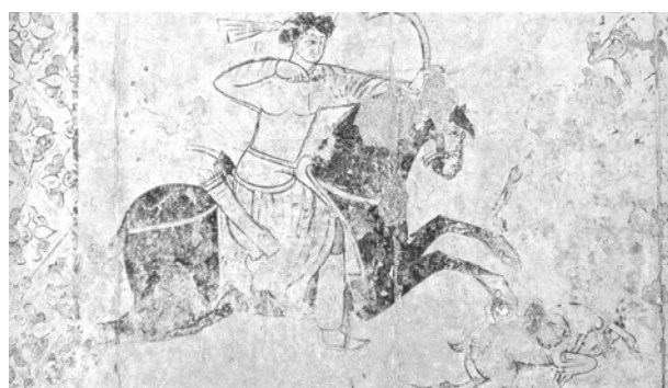
Figure 2 Detail of fresco, Qasr al-Hair, 725 c

“According to what has been said when Mansur the Abbasid caliph established Baghdad, he ordered placing the image of a warrior on horseback on the dome of his palace which moved when the wind blew. Such works in Samarra and Egypt have been discovered brimming with animal pictures (Zaki, 1993, p.8). In Mansur's time the walls of the palaces of Baghdad and Samarra were painted, and these are but a few among many examples.