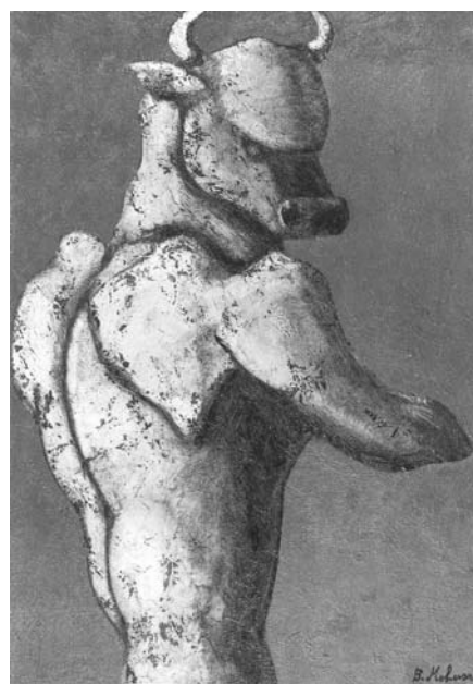
Figure 12 Miniature, Bahman Mohases, Oil on canvas, Tehran, 1961

Following the Islamic Revolution however, society reverted to Islamic culture and tradition (Figure 13, 14). Not only was there no prohibition on painting, artists were supported and encouraged. Nowadays in the Islamic world illustration and painting are increasingly well endowed. This plays an important role in developing Islamic and international culture in societies.