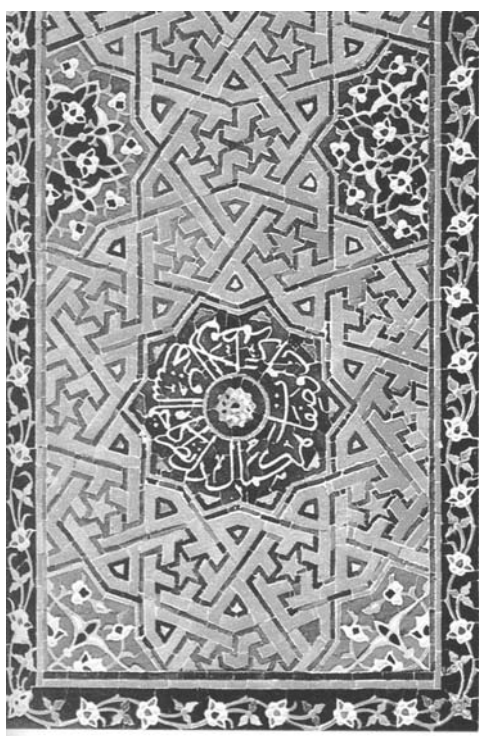
Figure 1 Detail, Tiling, Kaboud Mosque, Tabriz, 15 th Century

palace, pictures of horse riding, captive kings, dancing parties, and constellations appear in Sassanid relief style. The subject matter of paintings in the Moshatta castle and Touba palace are plants and birds. Also the paintings in Jowsaq al Khakani palace in Samarra belonging to the 9th century, which have human and animal figures and plants (Figure 3). All have been created as the result of the changing theory on the prohibition of painting. Painting used only for decoration, is lawful.