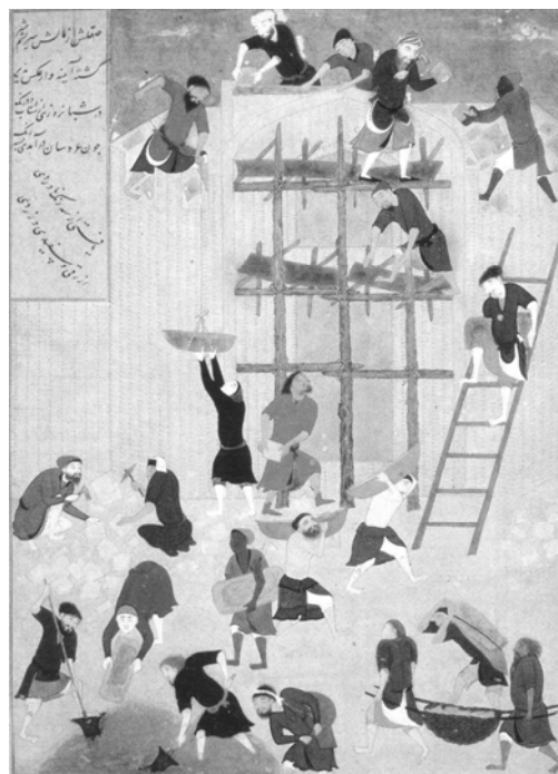
Figure 6 Construction of the Castle of Khawarnaq, Behzad, Herat, 1494, British Museum, London