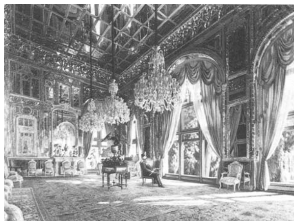
Figure 11 The Hall of Mirrors, Mohammad Ghafari (Kamal al-Molk), Tehran, 1888, Oil on Canvas, Gulistan Palace Collection

By the end of the Qajar era, Persian painting suddenly reverted to European painting in terms of theme and technique under the influence of Mohammad Ghaffari, known as Kamal Al-Molk (Figure 11). His students carried on his style through the Pahlavi era. Under the Pahlavi's, Persian painting went in the same direction as western painting (Figure 12). Under the influence of modernism, traditional and religious themes lost their power and popularity.