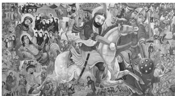
Figure 8 Battle of Karbala, Abbas al-Musavi, Late 19 th –early 20 th c, Oil on Canvas, 182.9x299.7 cm, Collection of K.

them to fight the Ottoman government. In the time of Shah Abbas (1600) Isfahan was the capital of Persia. Many calligraphers and professional painters were attracted to the city. Shah Abbas paid great attention to pictures and decoration of buildings and palaces. From those works some pictures have remained in two royal palaces in Isfahan.