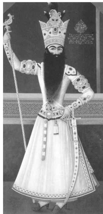
Figure 9 Portrait of Fath Ali Shah Standing, Mihr Ali, 1809-10, Oil on Canvas, 253x124 cm, Hermitage Museum, Saint Petersburg

increased and in line with it, freedom of action in painting also rose. In the reign of Fath Ali Shah, such art works reached their peak (Figure 9). The most important style of painting at that time was royal iconography. Another style of painting and public art emerged that focused on the dervish and coffee-house painting. The theme of these paintings are the epic heroes in Shahnameh (Book of Kings) and the depiction of the events of Ashura and Karbala. Although religious painting was ignored in Islam, it had many adherents and supporters in Persia. To do a charitable deed, or better to say, gain heavenly reward, dervishes displayed these scenes to people. Here shrouded martyrs were presented in public. Imam Ali's portrait was widely used for their illustration. But Ali's face was hidden in a halo while he was embracing his sword (Figure 10).