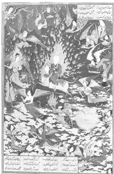
Figure 5 The Ascension of Prophet Muhammad, Khamseh Nezami, 1529-1543, The British Museum Library London