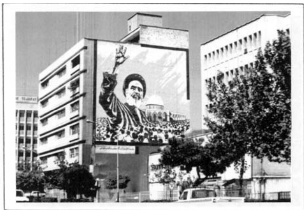
Figure 13 Portrait of Imam Khomeini, Mural painting, Tehran, 1981