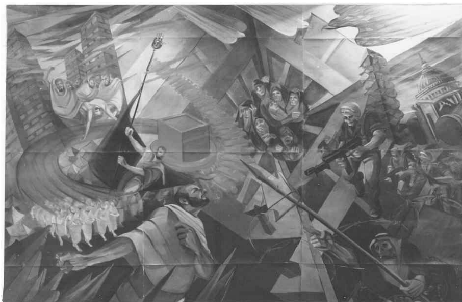
Figure 14 Bloody Friday, Author, Mural painting, Oil on canvas, Tehran, 400x600 cm, 1987

As previously stated, the prohibition of painting animal forms was a result of the concern over newly converted Muslims returning to their former idolatrous ways. In the age of caliphs and kings painting became commonplace and popular. Islam was firmly established