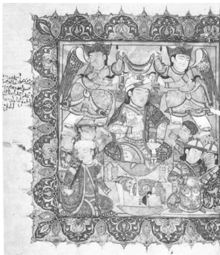
Figure 4 Frontispiece to al-Harriri, Maqamat , Syria, 1334, 37x25.5 cm. Vienna, Nationalbibliothek

In the early 14 th century, Ilkhanid miniature painting developed in Persia. Ahmad Musa is one of the initiators of this style. In 1330, he served in the court of Abu Saeed and established the art of miniature painting, and set up special schools for it. It's obvious that there was no painting prohibition in the days of Ahmad Jalayer's government in Baghdad and Tabriz.