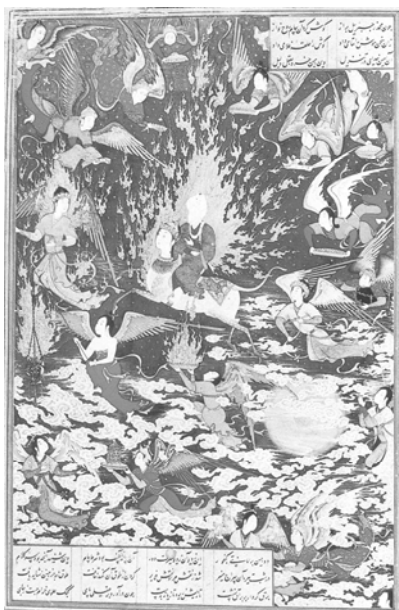
Figure 5 The Ascension of Prophet Mohammad, Khamseh Nezami, 1529-1543, The British Museum Library London