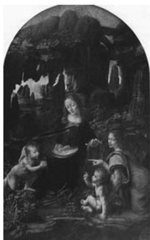
Figure 12 Leonardo Da Vinci, Vivgin of the Rocks, 1485 A.D. Oil on Wood (Transferred to Convas) Louvre, Paris. (Gardner)

distance between the ordinary people and sacred characters which has been gradually removed in the Renaissance paintings, and the fondling presence of light intensifies the emotion and feeling besides relief and perspective, making the relationship among the figures more natural.