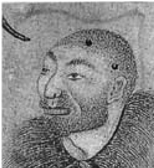
Figure 4 Behzad's drawing (expressionism in portraiture) Detile of Fig. 7.