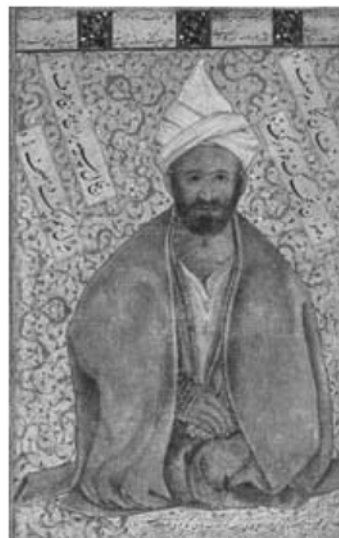
Figure 6 Portrait of a Dervish' By Bihzad, 1500 A.D.; 14.5 x11 cm. Private Collection (E. Bahari).