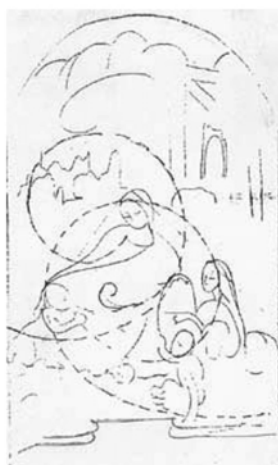
Figure 17 Spiral infrastructure in da Vinci's work [Virgin of the Rocks].

compositions conformed on spiral have been used. The lines of compositions are graphically displayed in conformity with the aforementioned works. One of the main factors, which have given life, dynamism and movement to the works of Behzad and da Vinci, are the use of such methods and styles for creating a relationship between the architectural spaces and figures, gestures and movements. Conforming infrastructure of compositions on the spiral are among the common features in Behzad and da Vinci's works, which turn the audience's eyes from outside into inside and all across the works.