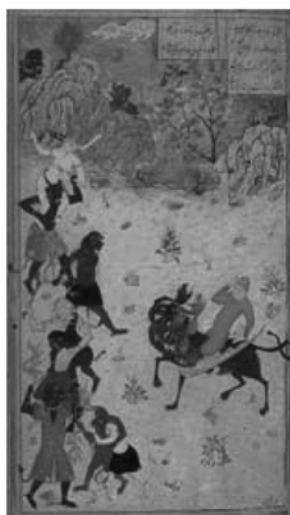
Figure 13 Mahan and the Demons' Attributed to Bihzad, from Khamsah of Nizami, 1490 A.D.; f. 188r, C. 15 x 10cm. BL, Add. 25900.

Such unusual drawings and extraordinary portraits require powerful imagination and skillful hand. In this respect, his miniature, Mahan and the Demons ' "Khamsah Nizami" (1490/ 900 A.H.) (Figure 13), where he portrayed the story of Mahan and demons can be referred. In these paintings, he displayed the demons with human-like bodies and animal-like heads. There are also some drawings by Leonardo da Vinci, like "Grotesque or Caricature" (Figure 14), where he changed the faces into an extraordinary form. Leonardo's power of imagination had been capable of deforming and totally changing the faces and figures. This also indicates that there might have been people with strange faces, from which these paintings and unusual drawings are derived for instance the portrait "Dervish" (Figure 7). Behzad and da Vinci have had a special interest in creating unusual and extraordinary figures and images.