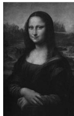
Figure 3 Leonardo Da Vinci: Mona Liza. About 1502 A.D. Paris, Louvre (E. H. Gombrich).