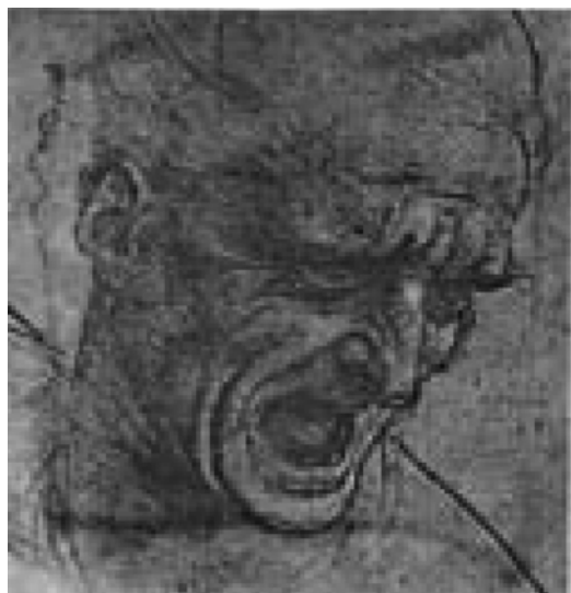
Figure 5 Da Vinci's drawing (expressionism in portraiture) (192 x188 ; Budapest, Szepmuveszeti Museum).