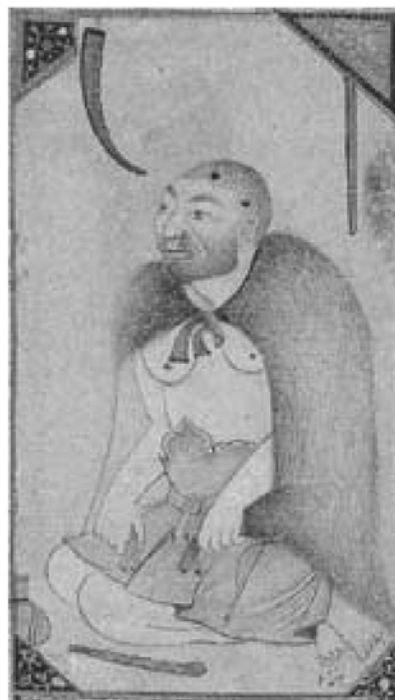
Figure 7 Portrait of a Dervish' By Bihzad, 1480-5 A.D.; 25 x17 cm. Topkapi Palace Museum Library, Istanbul, H2162, f.3r (E.Bahari).