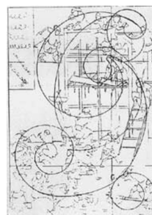
Figure 20 Spiral infrastructure in Behzad's work [The Construction of the Palace Khovarnaq].