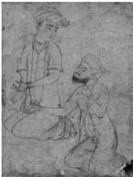
Figure 10 A part of Behzad's drawing (relationship among the figures).