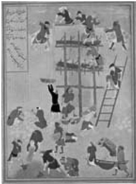
Figure 9 The Construction of the Palace Khovarnaq by Bihzad, from Khamsah of Nizami, 1494 A.D.; 20 x 14cm. BL, Or 6810. By Permission of the British Library (E. Bahari).