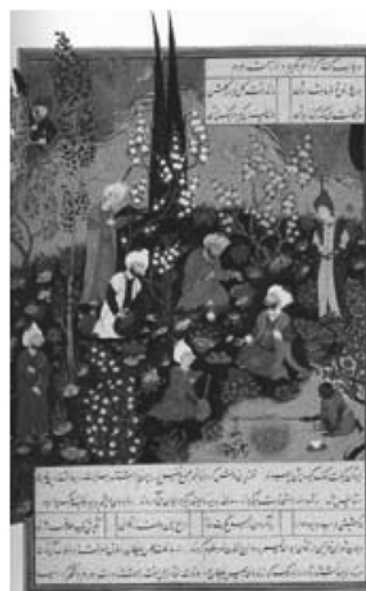
Figure 8 Firdowsi Encounters the Court Poets of Ghazna' Attributed to Behzad; from Shah Tahmasb's Shah nameh, 1525 A.D.; f. 7r, C. 20 x 14cm. Collection of Prince Sadruddin Aga Khan, Geneva, nM 185 (E.Bahari)

these pre-determined customs are totally left aside, the King (Shah) is better identified beside the rest and expressionism and natural relationships among the court servants and guests, who are present at the King's feast, are well explained. Moreover, in the miniature, "The Construction of Palace of Khowarnaq" (1494/ 899 A.H.) (Figure 9), there is an internal relationship among the workers and masters. A dynamic coordinated visual structure has been created. This fairly dynamic and relative composition and the use of more persons in the miniature have resulted in Behzad being entitled as the "Oriental Raphael". Most of the original miniatures attributed to "Behzad" have such features. Two drawings of "Behzad" (Figure 10) and "da Vinci" (Figure 11) represent the emotional relationship among the figures.