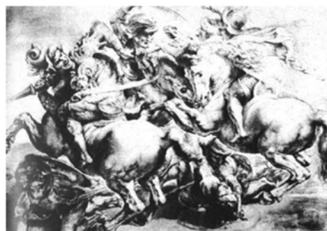
Figure 16A The Battle of Anghiari; The work originated in (august1504 -6); famous copy by P. P. Rubens-1605 A.D. (Paris, Louvre).

The same interest in war instruments, techniques, tactics and scenes could be found in Leonardo's works. Leonardo draws a painting from "The Battle of Anghiari" (1490/ 900 A.H.) (Figure 16A), of which there is no trace and only a reference could be made by Rubens' note of this work. Leonardo was known as a war painter. He was a military engineer and several drawings of war tools and instruments are left from him. (Figure 16B), Accordingly, Behzad, in "Zafar-Nameh" and other works such as "Bahram's Fight with Dragon" and "Battle of Leili and Majnun's Tribes", has paid much insight to real and imaginary war instruments while demonstrating war scenes.