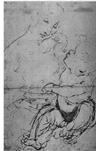
Figure 11 Leonardo Da Vinci: A part of da Vinci's drawing (relationship among the figures) The work is Typical of the Florentine Quattrocento and sir Kenneth Clark dates it a Dish of Fruit to the Child (pen, 330 x 250mm) Paris, Louvre.

Among Leonardo da Vinci's creations in addition to the wall painting of " The Last Supper ", in which the relationship among the Apostles is portrayed another is oil painting, " Virgin of the Rocks " (1485/890 A.H.) (Figure 12), containing the same features. The delicate relationship among the mother, the child and other characters is obviously felt. The pyramidal composition and the people's gathering in one place as well as their relationship, the omission of circumference lines and the use of fades are all characteristics of Leonardo da Vinci. "This is Leonardo's famous invention which the Italians call " sfumato "- the blurred outline and mellowed colours that allow one form to merge with another and always leave something to our imagination 15 ." In this painting, there is nothing viewed of the sacred circles above Virgin and Christ to identify them from the other people. This phenomenon creates a special