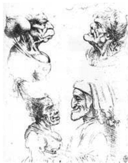
Figure 14 Leonardo DaVinci: Drawing of 4 grotesque heads(Windsor, Royal Library; 1490 A.D.).