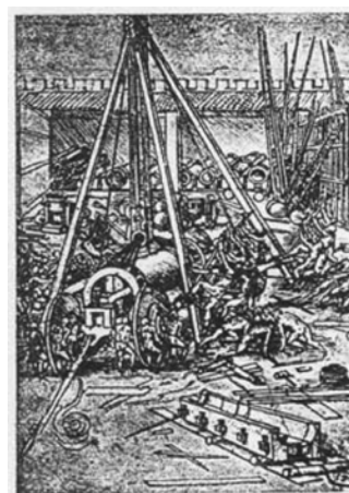
Figure 16B Project for the casting of a gigantic cannon (Windsor, Royal Library ).