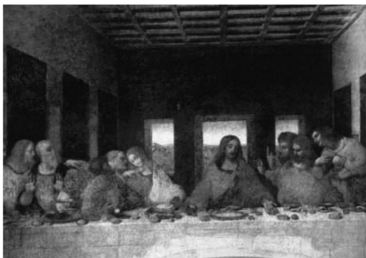
Figure 2 Leonardo Da Vinci: The Last Supper.

“Restoring the glory of Renaissance Frescoes, the painting is both formally and emotionally his most impressive work 9 .”